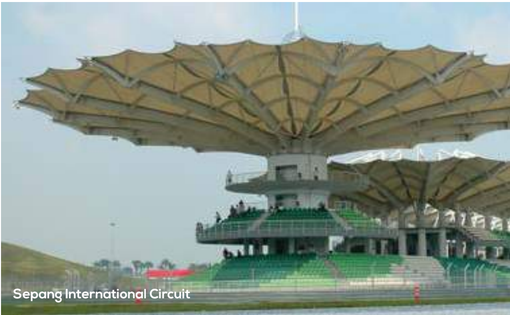
Sepang International Circuit