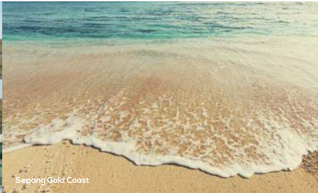
Sepang Gold Coast