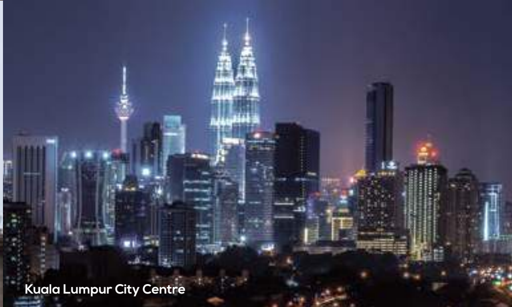
Kuala Lumpur City Centre