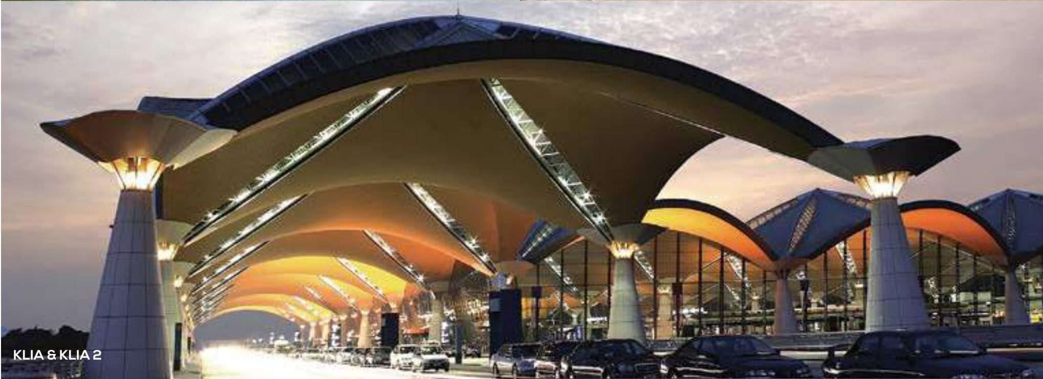
KLIA & KLIA 2